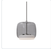
PD70610-SM/BN-UNV Smoked/Brushed Nickel