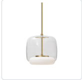
PD70610-CL/BG-UNV Clear/Brushed Gold